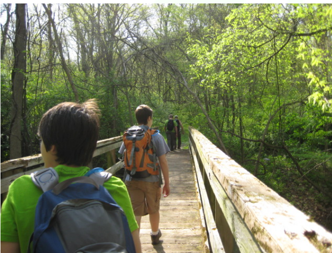
Good Day For Hiking