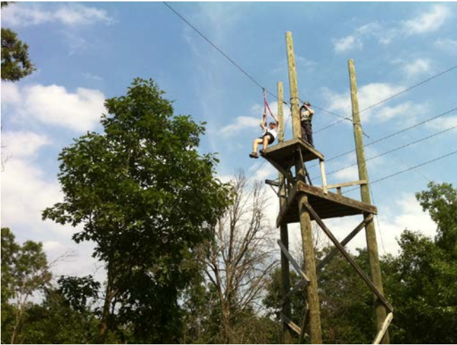
The Zipline @ CFL