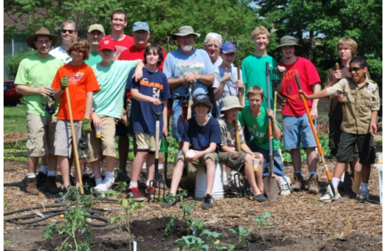
Service @ The Batavia Community Garden

Troop 43 Meeting Location Congregational Church Route 31 Batavia, IL